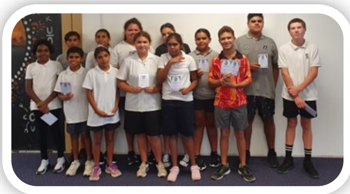
Some of our 2020 Secondary students